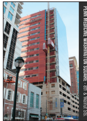
PERIM MEDICINE WASHINGTON SQUARE - 6TH & WASHINGTON

Corporate Headquarters: Fort Washington, PA 215.283.9444 Exton, PA 610.594.9995 Camp Hill, PA 717.925.0295 Yardville, NJ 609.585.5745