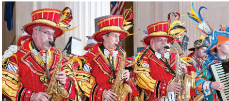
After the speeches and ceremony, the Aqua String Band is turned loose to serenade our Anniversary.