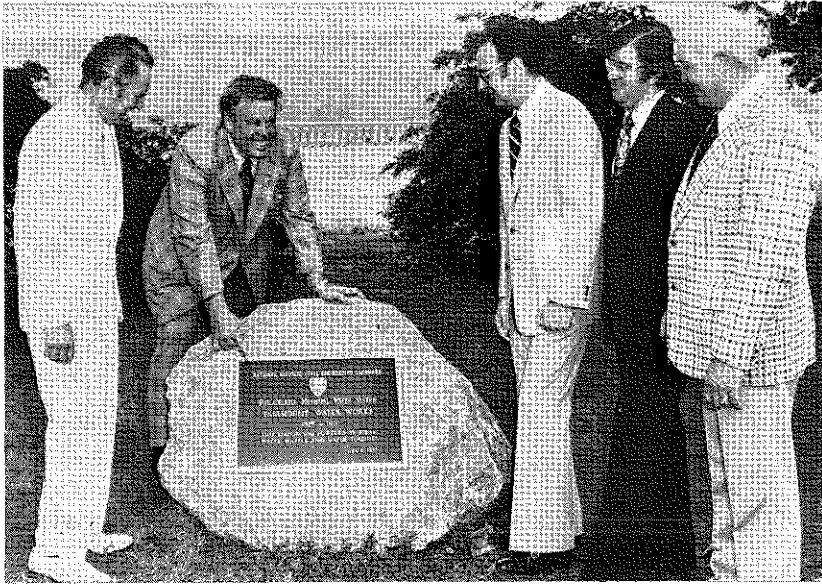
At Fairmount Water Works — Bronze plaque is mounted on a rock on the grounds of the old Fairmount Water Works complex adjoining the Phila. Museum of Art (which stands at the site of the original storage reservoir). The station was powered by steam, water wheels and water turbines, and was in operation from 1815 to 1911.